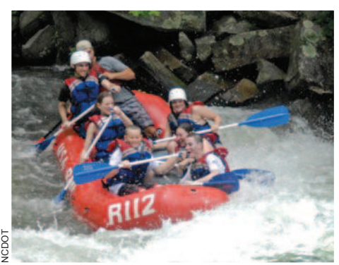
Whitewater Rafting on Nantahala River

because it is near the state's largest marble deposit. This marble, in addition to other mineral resources found in this area, is of such high quality that it was used extensively at Arlington National Cemetery. From